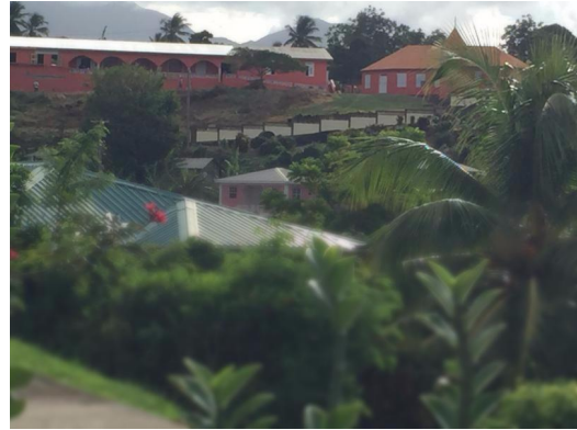
Looking Uphill To the Church Hall