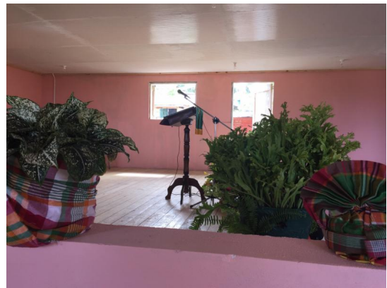
The Microphone is Ready, and the Hall is all setup!