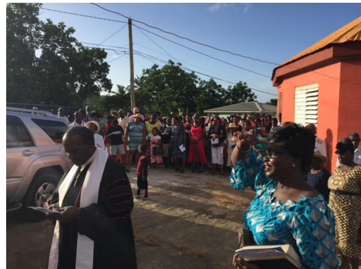
The People Gathered